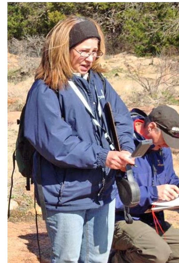
"We're supposed to go where!"

his clothing! That makes sense. I knew that ticks are extremely sensitive to heat and will drop out of trees on deer and people passing below. Years ago I researched chiggers for an article I had published in Motorhome magazine. Chiggers are also attracted by our body heat and will actually chase you down. Chiggers have soft bodies and love the humidity of